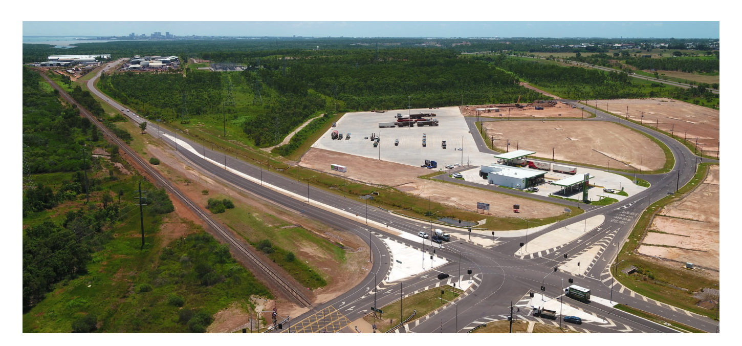
Wishart Estate is an industrial estate created for Darwin's future.